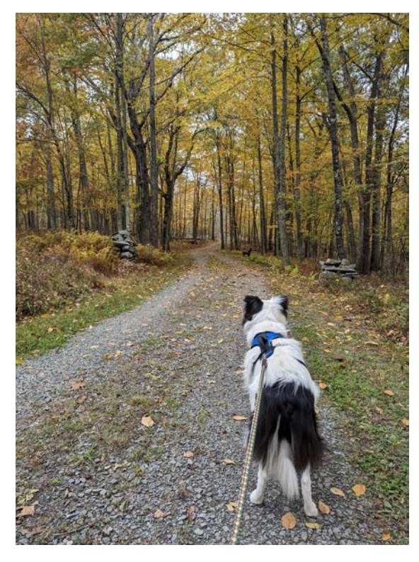
Get to Know Your Parks Veterans & Sunrise Parks! See Page 6